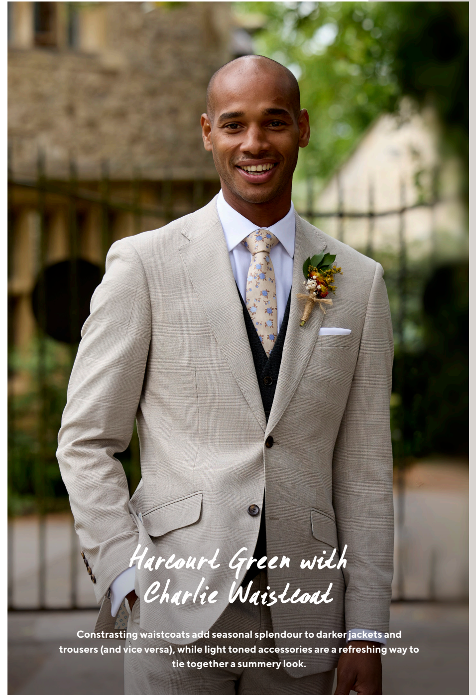
Harcourt Green with Charlie Waistcoat

Constrasting waistcoats add seasonal splendour to darker jackets and trousers (and vice versa), while light toned accessories are a refreshing way to tie together a summery look.