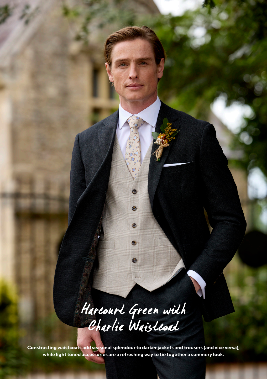
Harcourt Green with Charlie Waistcoat

Constrasting waistcoats add seasonal splendour to darker jackets and trousers (and vice versa), while light toned accessories are a refreshing way to tie together a summery look.